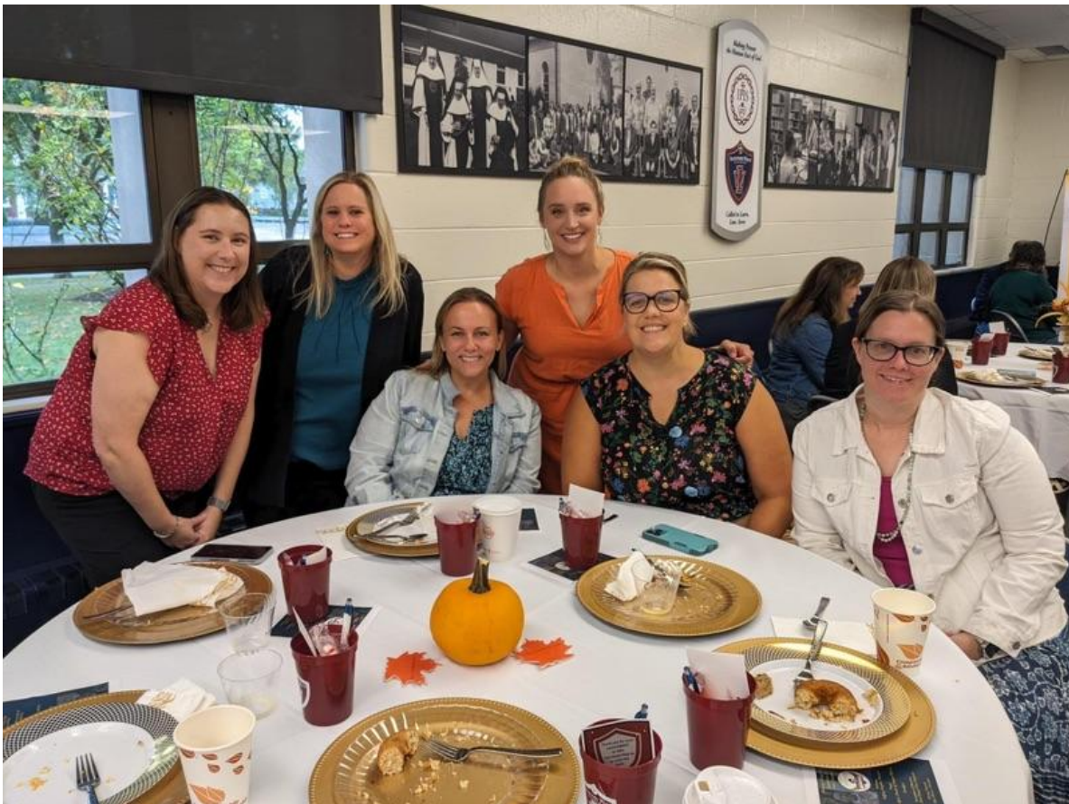
On Thursday, we paused to say thank you to all of the volunteers and community partners that give their time and talents to help support the mission of our school.