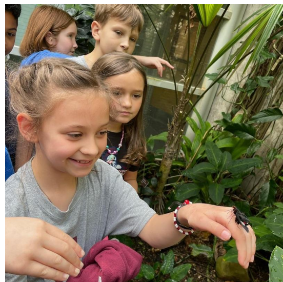
Third Grade discoveries at the Botanical Gardens