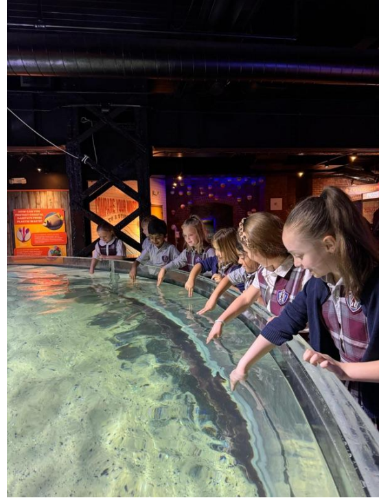
Kindergarten explores the Aquarium