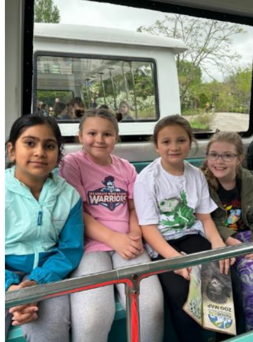
Second Grade makes their way to the Cleveland Metroparks Zoo