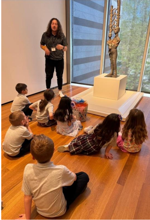
Kinder Prep at the Cleveland Museum of Art