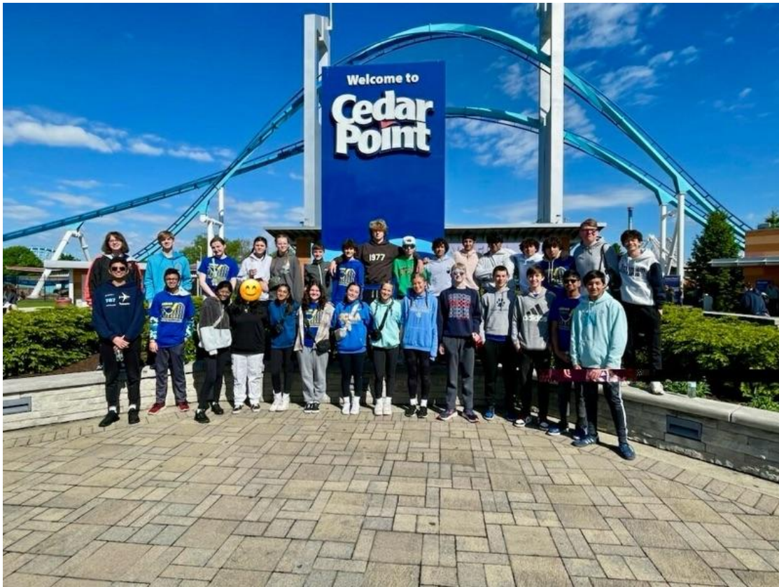
Eighth grade travels to Cedar Point for the Physics, Science, and Math Days