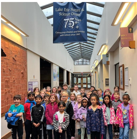
First Grade visits the Lake Erie Nature and Science Center