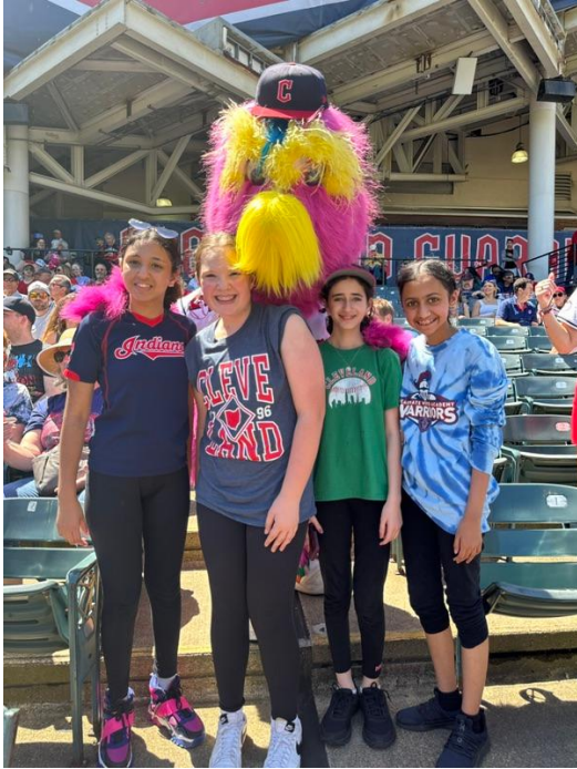
Preparatory Baseball Enrichment course culminates at Progressive Field